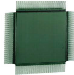
PWE with 3" Expanded Metal