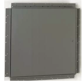
PW with 3/4" Plasterguard Wings

Standard Color is White, Optional Colors at Additional Cost